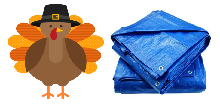
Turkey and Tarps Drive

"It is more blessed to give than to receive." — Acts 20:35