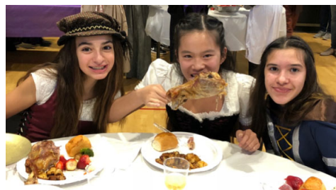
7th Grade Medieval Day