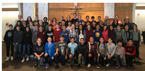
6th Grade Science Camp