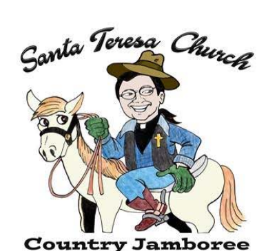
Howdy Partner! Bring your appetite and join us for some finger-licking delicious food and family fun!