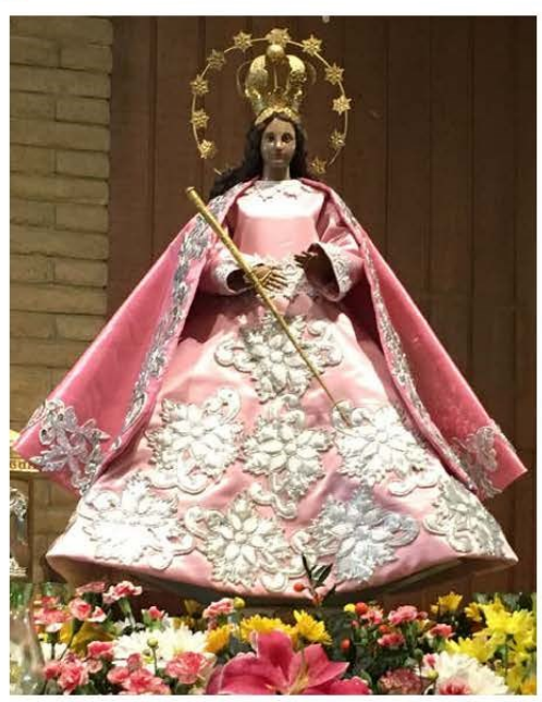
OUR LADY OF ANTIPOLO