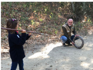
Visiting Chitactac Adams Heritage Park.