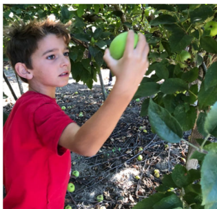
Learning about apple harvest and juice production.

Thank you to our wonderful teachers for extending their classrooms for our students and to the countless parent chaperones and drivers who make all these trips possible.